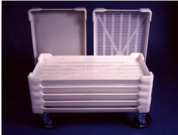
BB10-C and BB 10-V with BB-1630P-5 dolly