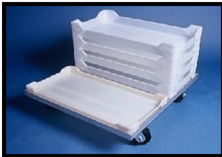
BB-8C and BB-1630-5C with BB-1630A-2UP dolly