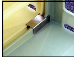
Locking hold-down option