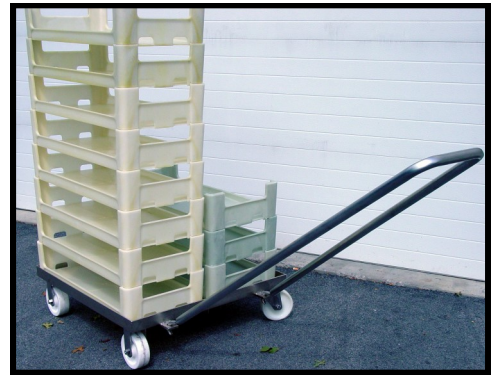
End-wall vents eliminate oversaturated bottom fish Self-stacking trays increase retort capacity by 50%