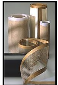
Roll stock belts

Flexible or rigid, non-stick, sanitary Teflon® copolymers eliminate product damage, cups, parchment, oils, packaging, flour and consumables