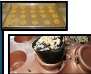
Flexible candy molds