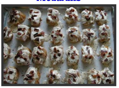
Appetizers MULTIPLE USES FROM COOKIES TO CHICKEN WINGS!