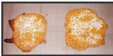
"BAKED ON" CHEESE TEST