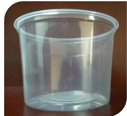
16 OZ. (XL)