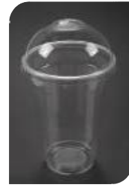
20 OZ. (B)