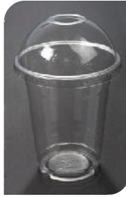
15 OZ. (B)