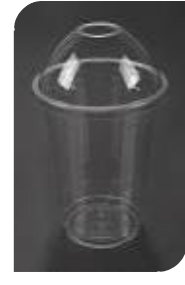
16 OZ. (A)