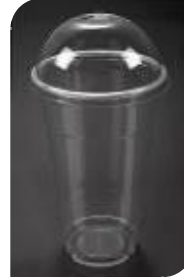
24 OZ. (B)