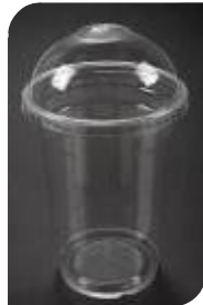
16 OZ. (B)