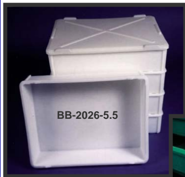
CROSS-STACK LOCK or NON-CROSS OPTIONS