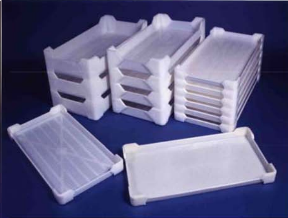
BB-1630-5V, BB-9V, BB-10V BB-10V and BB-10C