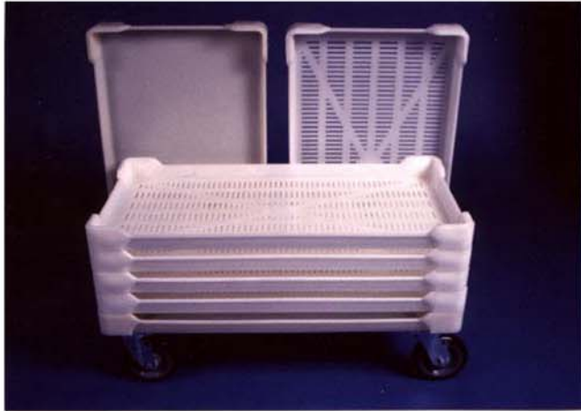
BB10-C and BB 10-V with BB-1630P-3 dolly

VENTED OR SOLID BOTTOM AIR-FLOW SANI-TRAYS®